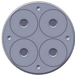
Narrow - Polished Face