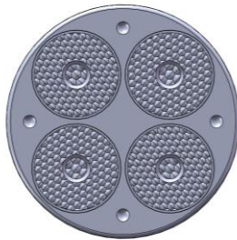
Medium - Textured Microlenses