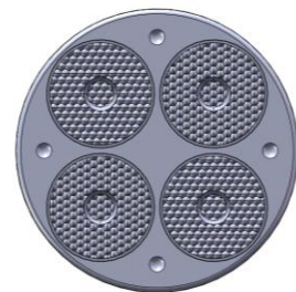
Wide - Polished Microlenses